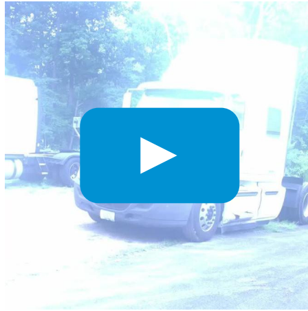
Truck Moving Forwards and Backwards