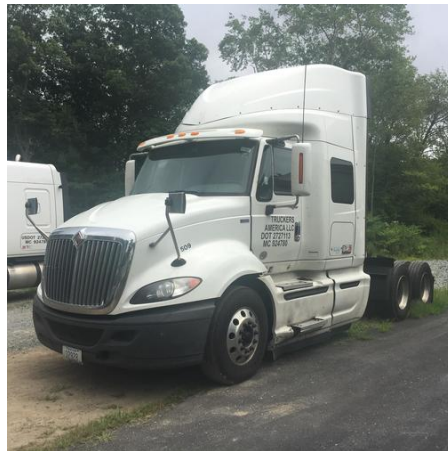
Driver Side Front Corner Full View