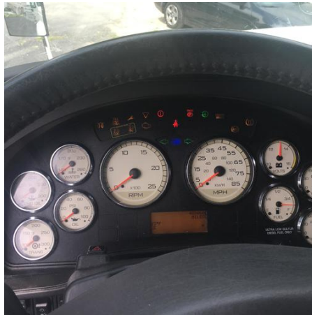
Dashboard Full View (key on if available)