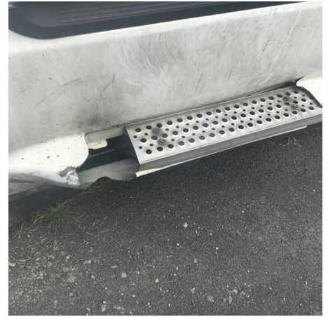
Driver side lower step