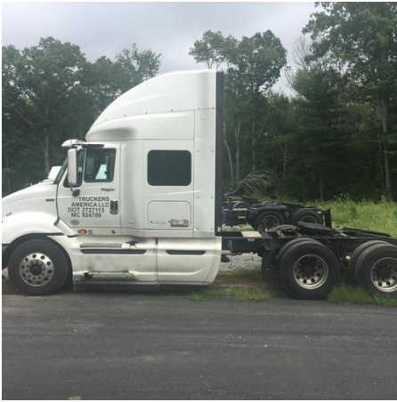
Driver Side Full View