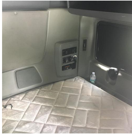
Sleeper Cab/Rear Interior 2 (if applicable)