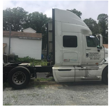
Passenger Side Full View