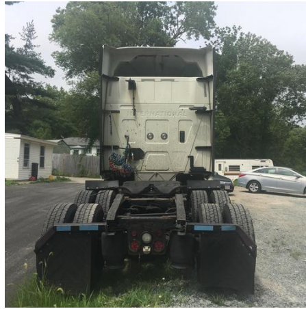
Rear Full View