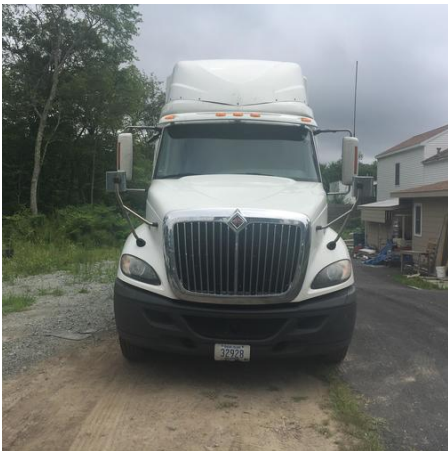
Front Full View