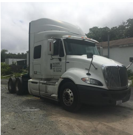
Passenger Side Front Corner Full View