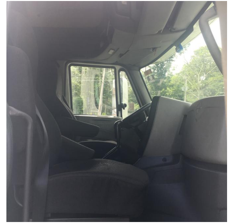
Passenger Side Interior Full View