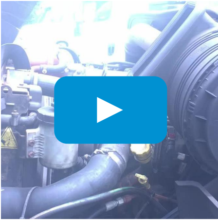
Engine Running Hood Up (showing timing belts etc)