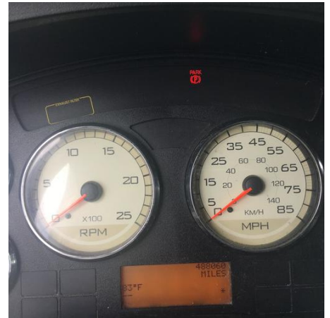
Odometer/Hours Reading (key on if required/available)