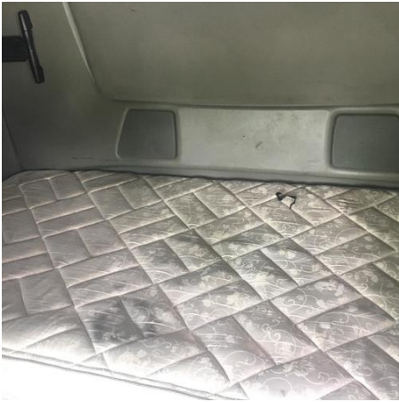
Sleeper Cab/Rear Interior 1 (if applicable)