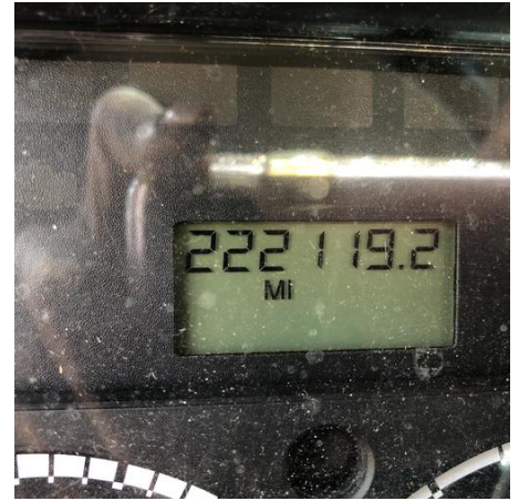
Odometer/Hours Reading (key on if required/available)