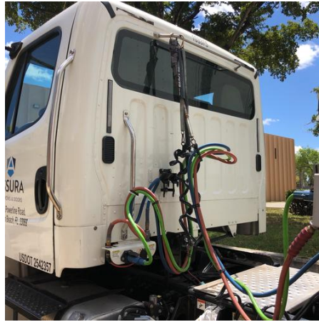
Rear Full View