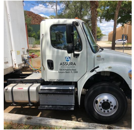
Passenger Side Full View