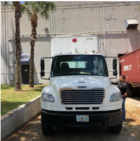
Front Full View