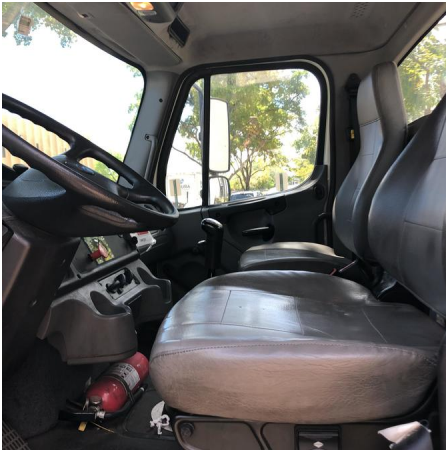
Driver Side Interior Full View