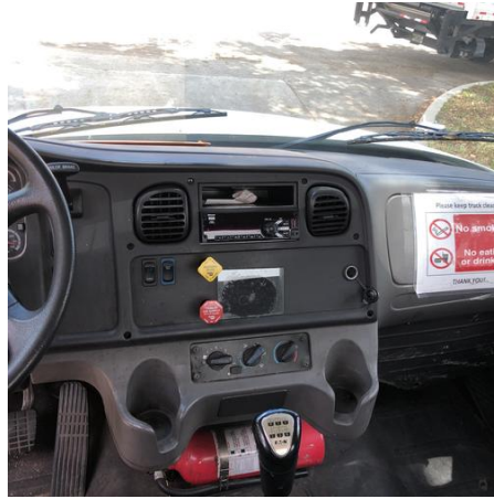
Dashboard Full View (key on if available)