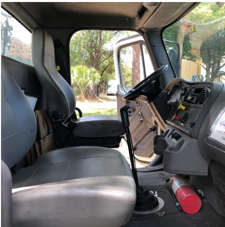
Passenger Side Interior Full View