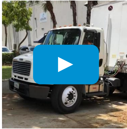
Truck Moving Forwards and Backwards