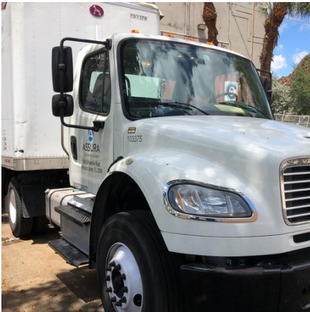
Passenger Side Front Corner Full View