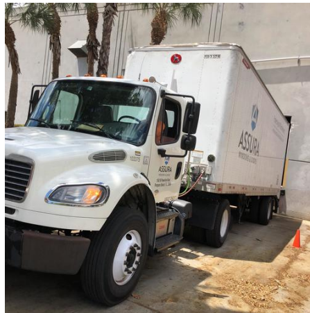
Driver Side Front Corner Full View