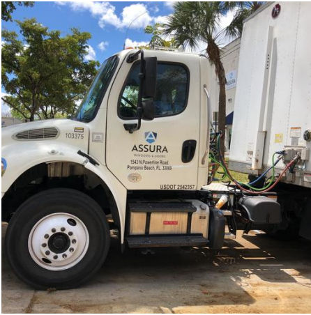
Driver Side Full View