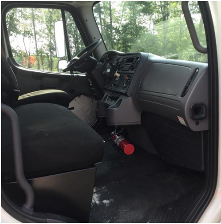
Passenger Side Interior Full View