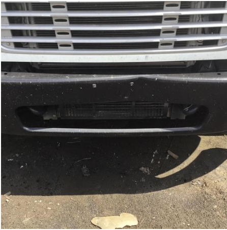
Front bumper slightly dented in center