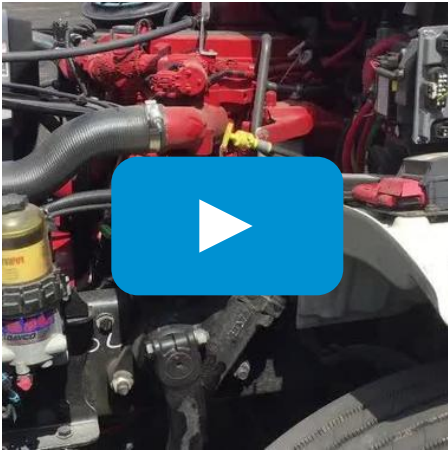
Engine Running Hood Up (showing timing belts etc)