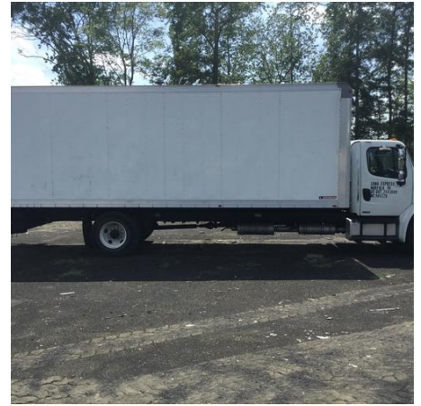
Passenger Side Full View