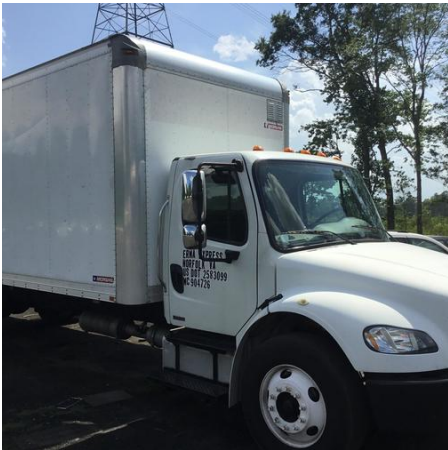
Passenger Side Front Corner Full View