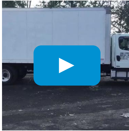
Truck Moving Forwards and Backwards