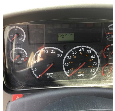
Odometer/Hours Reading (key on if required/available)