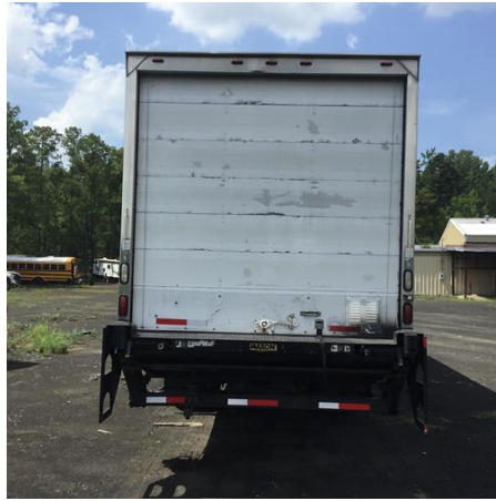
Rear Full View