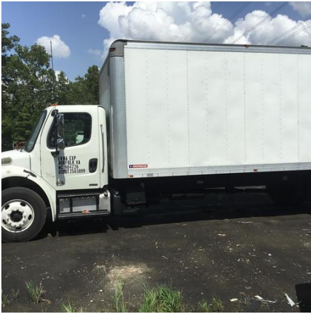
Driver Side Full View