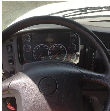
Dashboard Full View (key on if available)