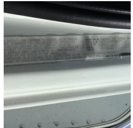
VIN Driver Side Door (if missing take where would appear)