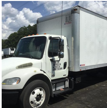
Driver Side Front Corner Full View