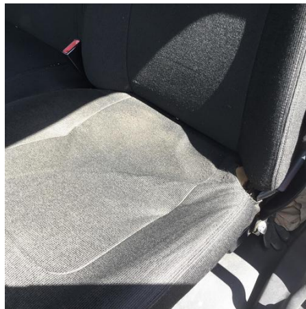
Normal wear and tear only