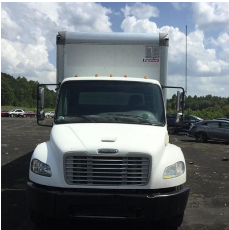
Front Full View