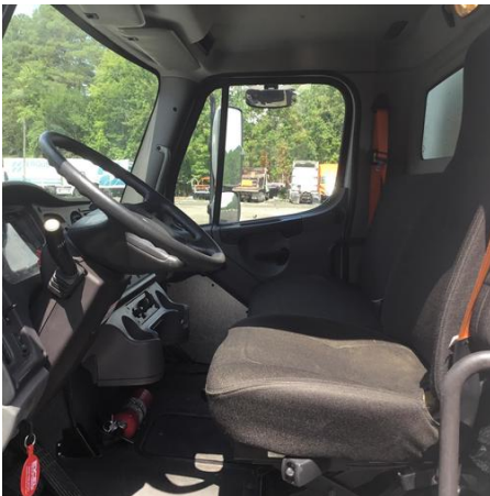
Driver Side Interior Full View