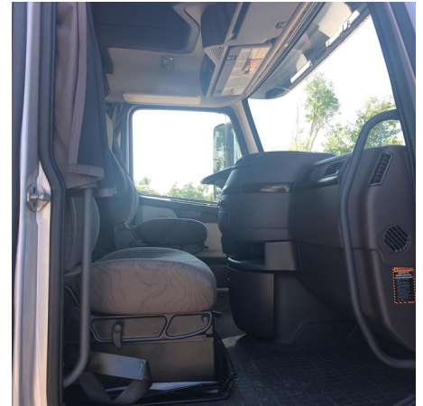
Passenger Side Interior Full View