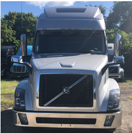
Front Full View