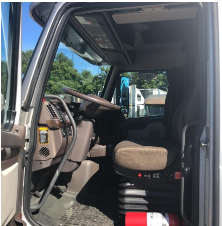
Driver Side Interior Full View