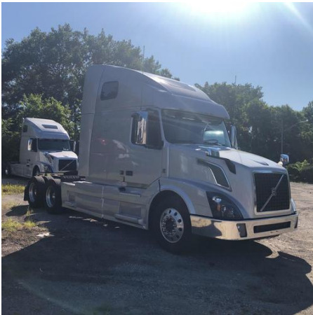
Passenger Side Front Corner Full View