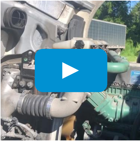
Engine Running Hood Up (showing timing belts etc)