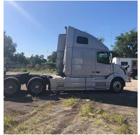
Passenger Side Full View