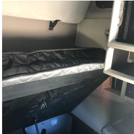
Sleeper Cab/Rear Interior 2 (if applicable)