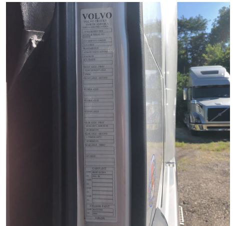
VIN Driver Side Door (if missing take where would appear)