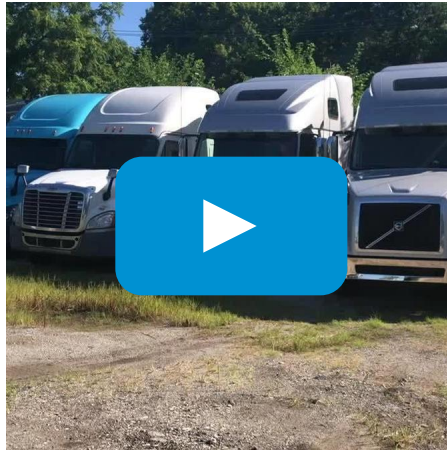
Truck Moving Forwards and Backwards