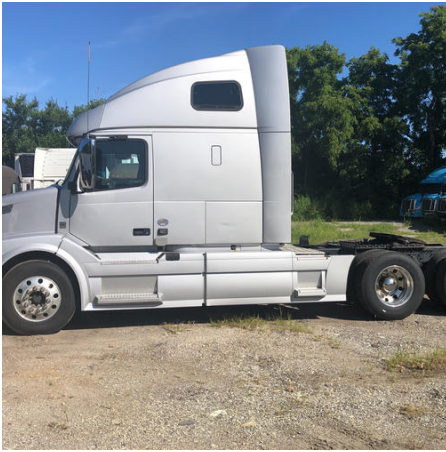
Driver Side Full View