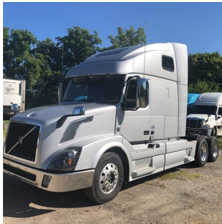
Driver Side Front Corner Full View