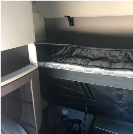
Sleeper Cab/Rear Interior 1 (if applicable)