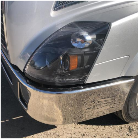
Drivers side from headlight and quarter panel scratches