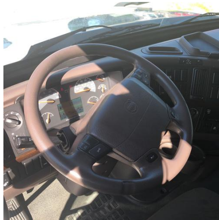
Dashboard Full View (key on if available)