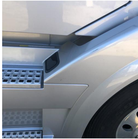
Minor scratches on passenger side door area