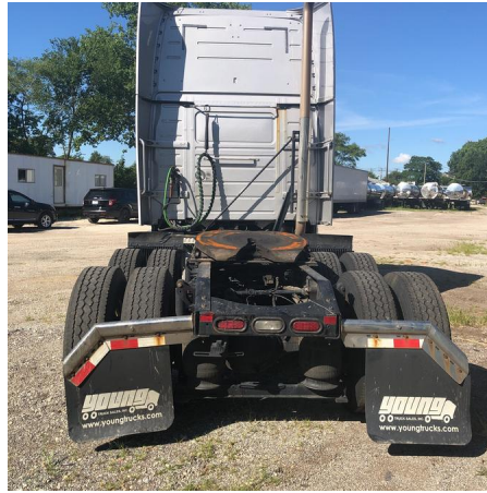
Rear Full View